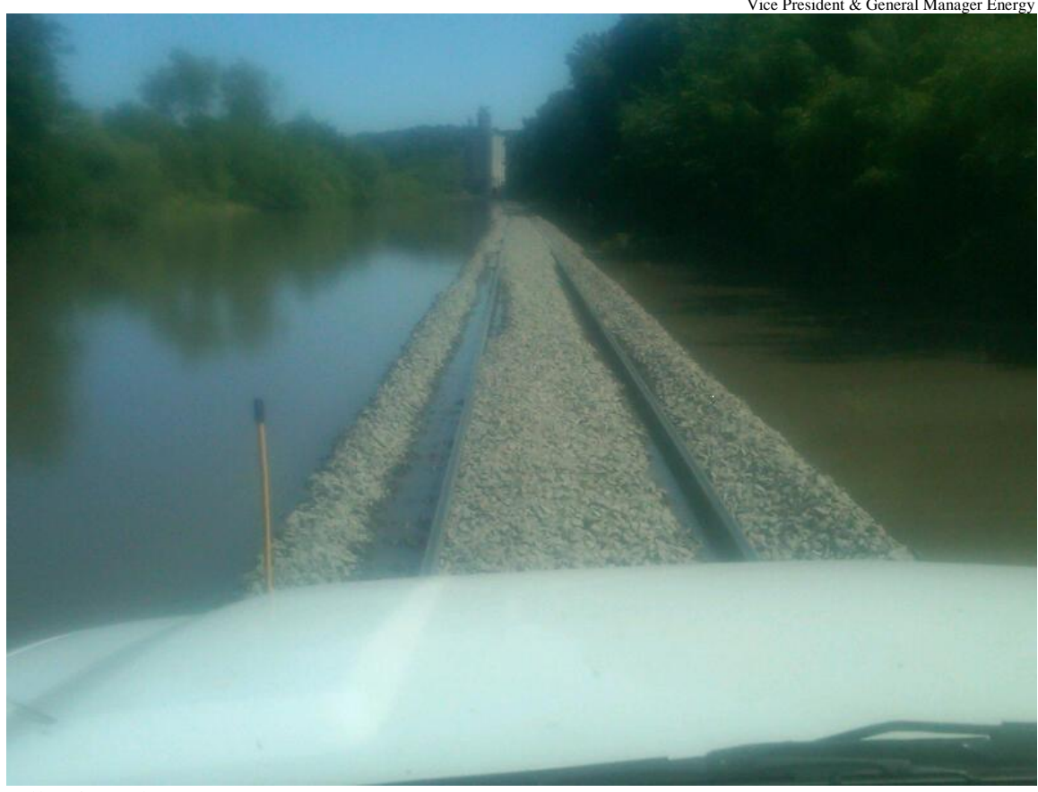
Falls City Sub